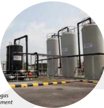
Effective biogas treatment

"Through POMETHANE®, we help you to meet your operational, economic and environmental challenges"