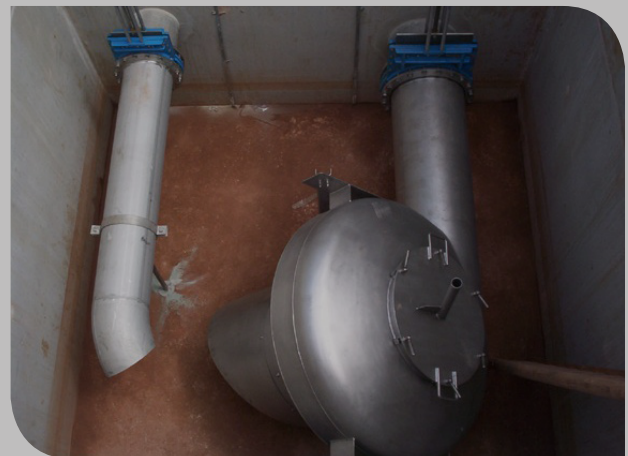
Figure 3: HYDROVEX® IHV Typical Installation